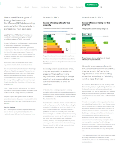
Content Relevant content pages